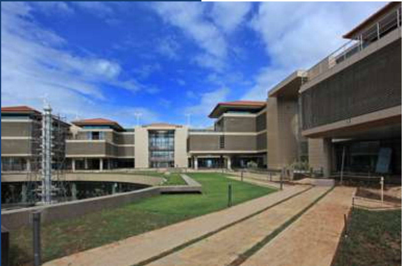
Image: Suzlon Earth one building in Pune

Municipal corporation in Pune has taken active participation in building green homes. The Pune Municipal Corporation's (PMC) has also launched ECO-Housing Program in 2008 to encourage the green development in the city.