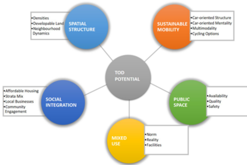
Figure 1: The five dimensions of TOD

Public Space and Mixed Use, all of them showing a direct link with the definition of TOD, i.e., a dense, mixed-use type of development around mass transit stations with attractive public space that promotes walkability (Cervero et al., 2004). The fifth category goes one step further and aims to include the dimension of Social Integration to avoid TOD's main side effect, gentrification. Figure 1 shows the five dimensions mentioned along with the aspects that each one of them has to take into account.