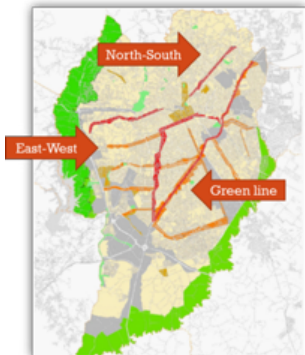
Figure 4: Land use plan

At present, there are four main corridors with 72 km of exclusive lanes mobilising 2 million people daily. This accounts for 70% of the commuters in Curitiba, pointing to the success of this measure when compared to the 7% of Public Transport users in 1970. Figure 4 clearly shows the BRT corridors and its relationship with the density scheme.