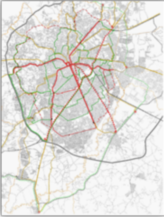
Figure 5: Integrated transport network