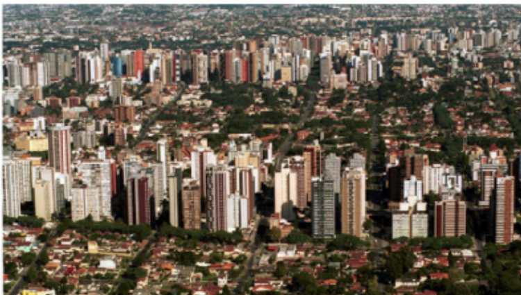
Figure 6: Urban Landscape of Curitiba

The Land Use Plan (Figure 4) displays an overall low-density city with some concentration of population density on the BRT axes (yellow and orange represent higher densities) and the transport network showed in Figure 5 reflects the concentric structure of the city. After 40 years since the implementation of the first BRT corridor, the result of this strategic plan in the urban structure of Curitiba is shown in Figure 6.