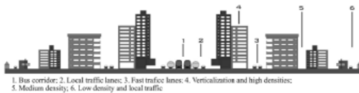
Figure 3: BRT corridor scheme: road hierarchy and verticalisation

infrastructure in an optimal way and to achieve the goals of the master plan, high densities were allowed only along the BRT corridors, following a hierarchical road structure which promoted a high concentration of people, retail commerce on the street level and mixed uses in general (Duarte & Ultramari, 2012). In Figure 3 the so-called trinary road system is shown, which is the mixture between transportation through the capacity and uses of the roads, and spatial structure through different density levels.