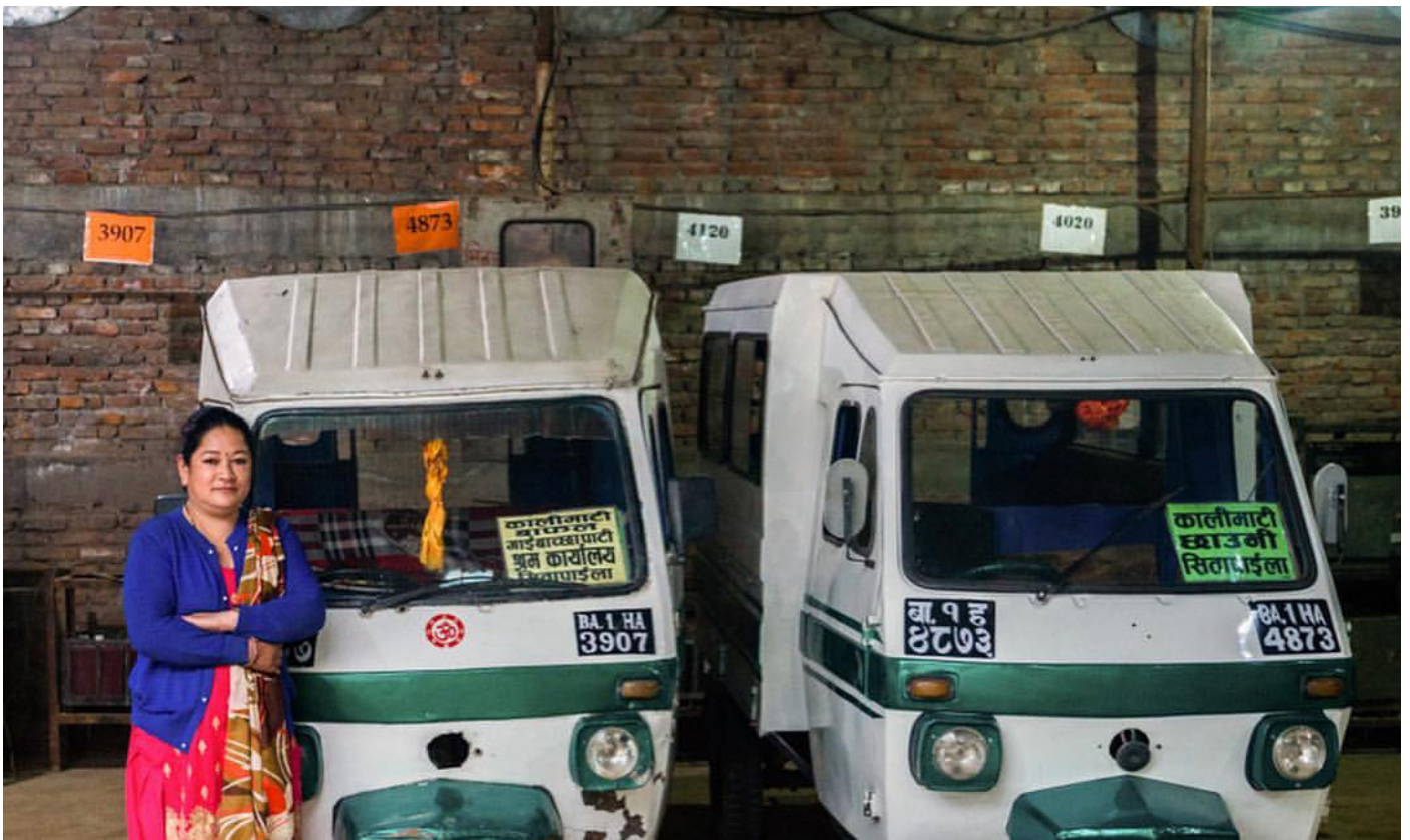
Safe Tempo and Woman driver