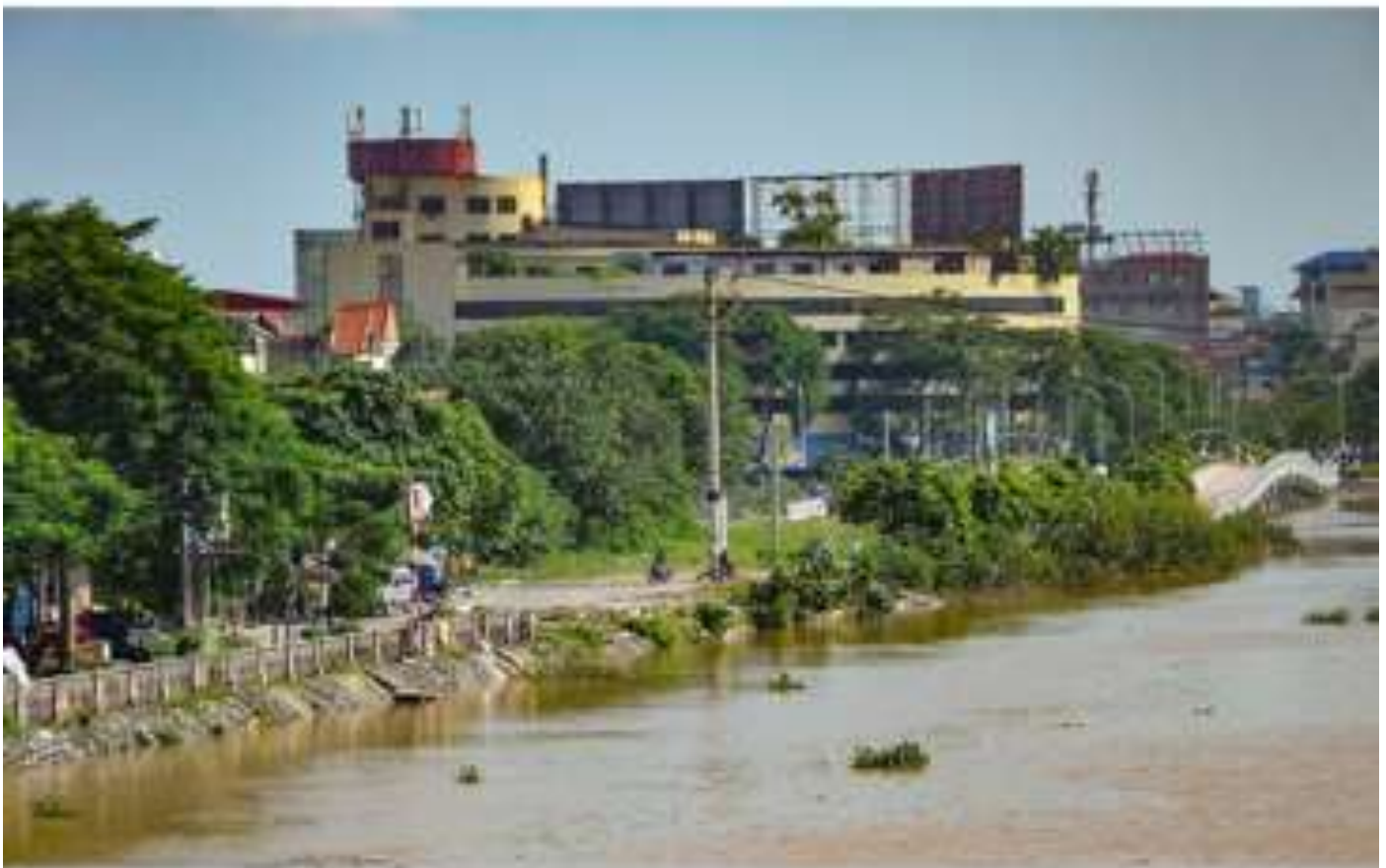
Figure: Current situation of the Tam Bac river front

Due to tourism flows and commercial activities in the area, vehicular movement is very high with huge risks to pedestrian. Pedestrian safety is also low due to the lack of allocated walking space, further evident with frequent and high volume of traffic accidents. With this in mind, the Tam Bac river front has the potential to be developed into a pedestrian friendly space by reducing vehicular movement, implementing energy efficient street lighting, and improving waste management. Hence, Hai Phong city plans to develop a project to redevelop the area along the Tam Bac river and Tam Bac Park to prioritise pedestrians and create an amiable public space for the citizens and the environment.