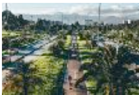
Mexico City, Mexico